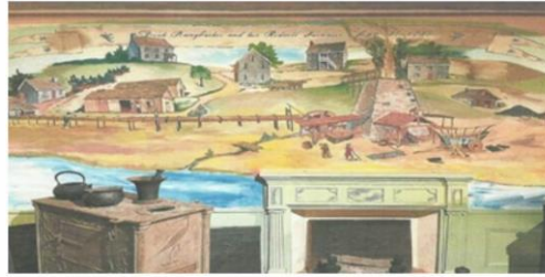
Redwell-Isabella Furnace Mural at Luray Caverns Shenandoah Heritage Village, Artists: Keeler Chapman and Rod Graves 2010