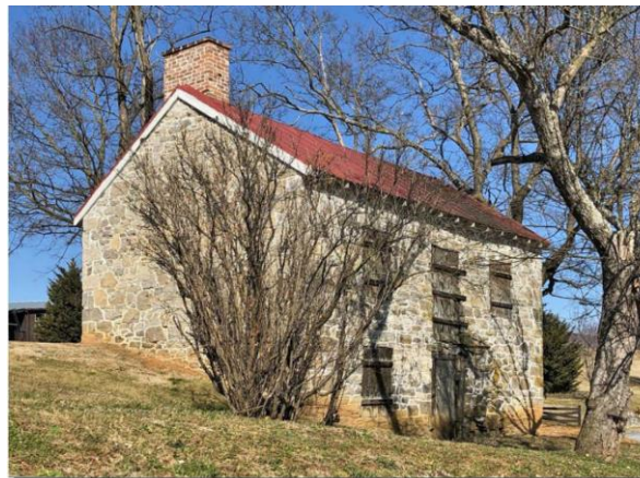
Redwell-Isabella Furnace